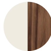
Cream & Black Walnut