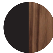
Black & Black Walnut